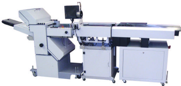
GBR 438 Stitcher Fold System

Applications to date include policy assembly and cross-folded product documentation.