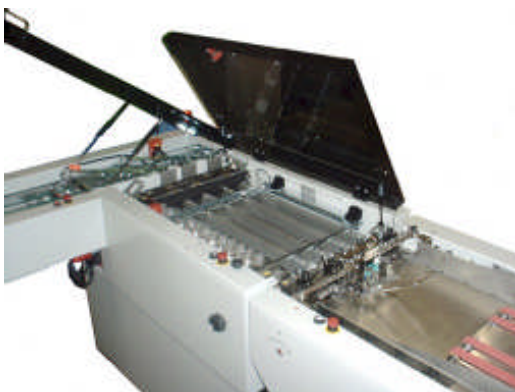
MB 904 Slitter/Merger